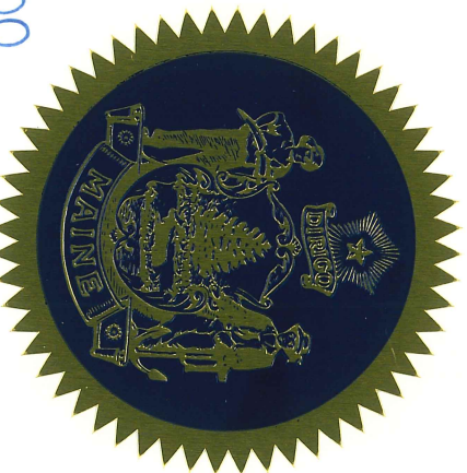
Janet T. Mills Governor

In testimony whereof, I have caused the Great Seal of the State to be herunto affixed GIVEN under my hand at Augusta this first day of September Two Thousand Twenty-Two